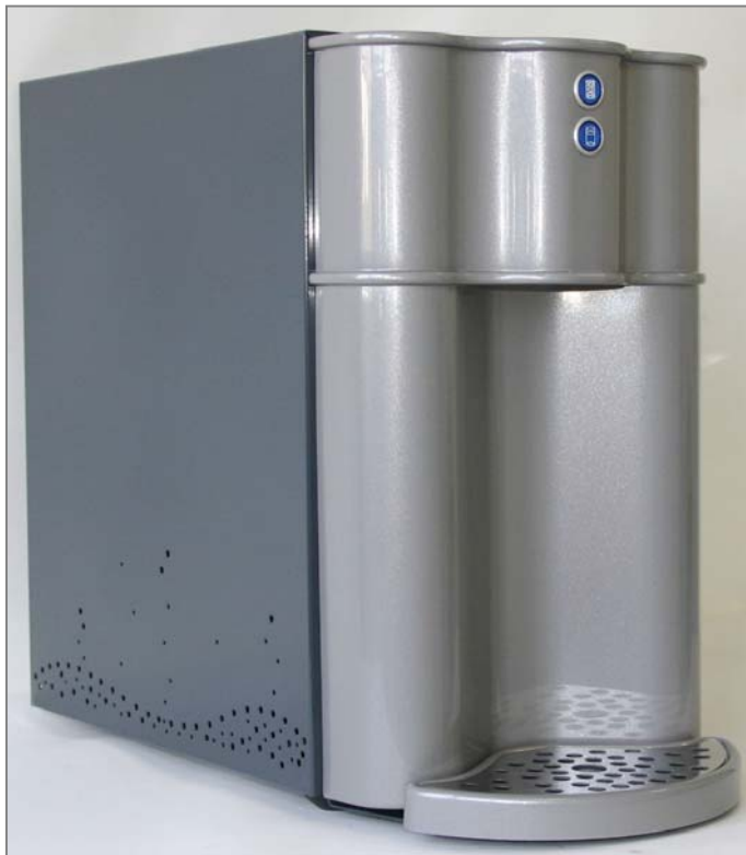
Table water dispenser POSEIDON

Drinking benefit purely! classic or still